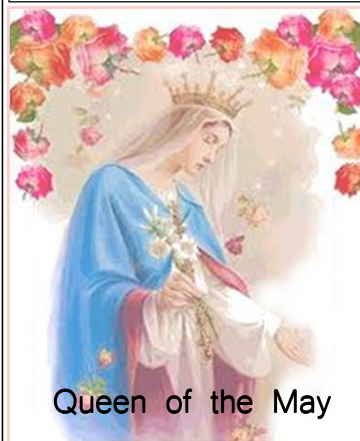
Queen of the May