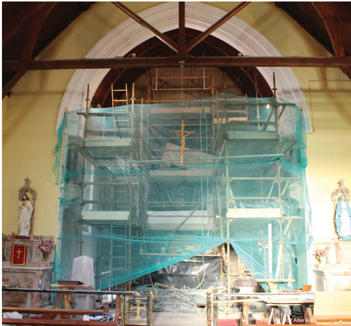
Fig. 001 Alter Area