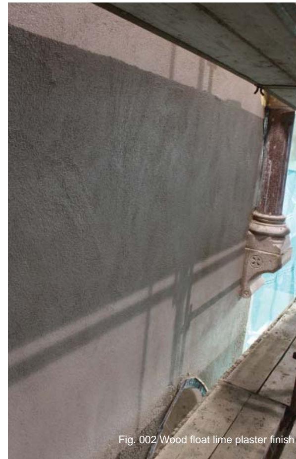
Fig. 002 Wood float lime plaster finish

Fund raising is progressing well and thank you for those who have donated already, we understand it's a challenging time for everyone and your support is greatly appreciated.