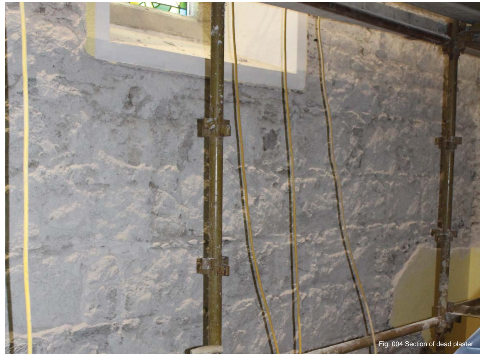
Fig. 004 Section of dead plaster