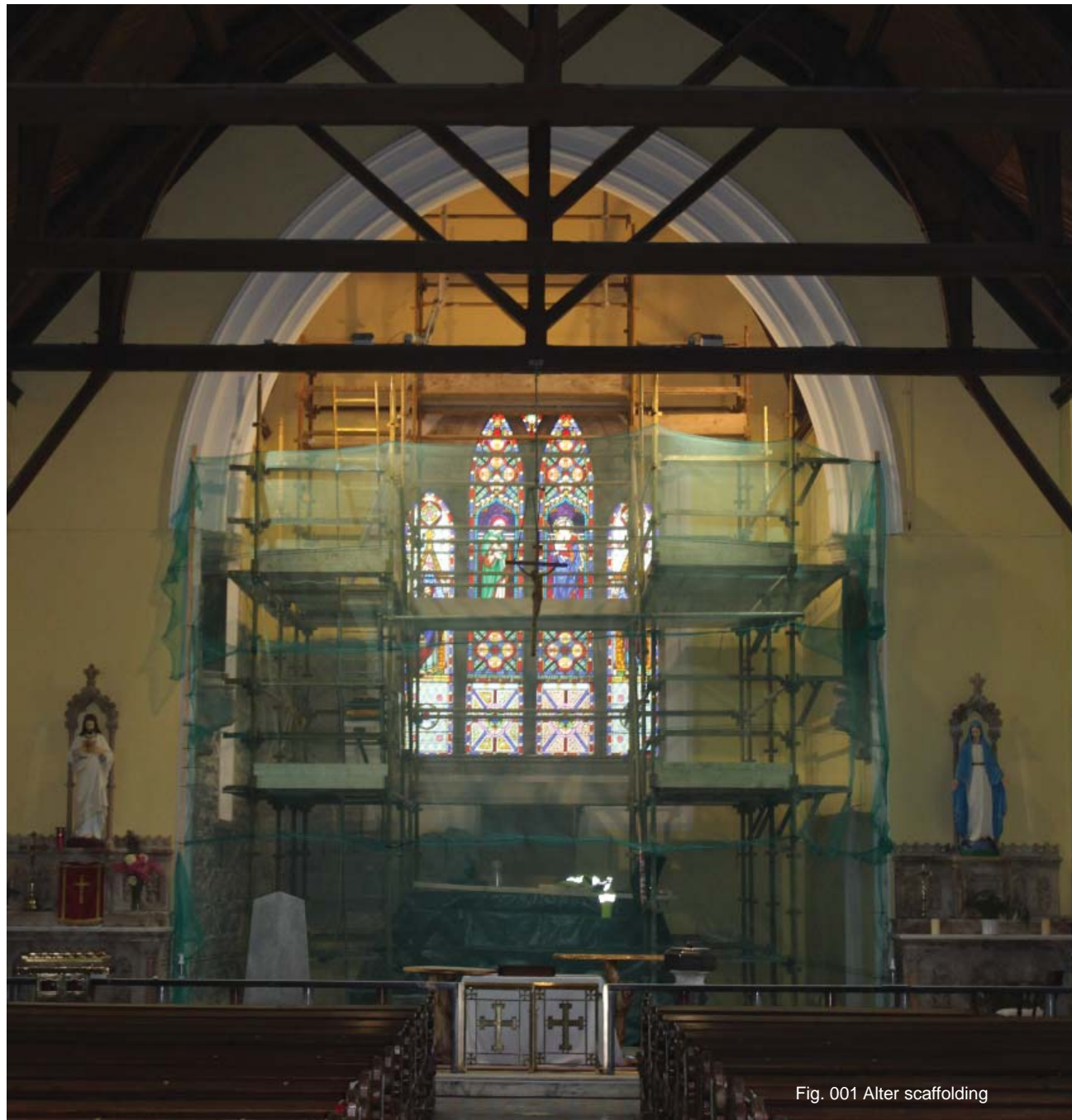
Fig. 001 Alter scaffolding